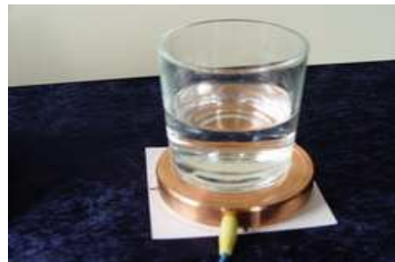
Specific vibrations can be transferred on several transmitters. In this case in a glass of water for internal or external use

occurred, there was no sign of strong healing reactions we know from