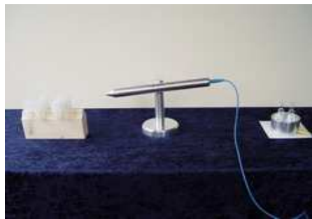
This picture shows the classical Bio-Energy emitter. Due his success story, this device was produced without changes already 25 years.

occurred, there was no sign of strong healing reactions we know from