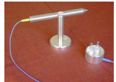
Medea 7 Bio-Energy Emitter with cup and ampoules