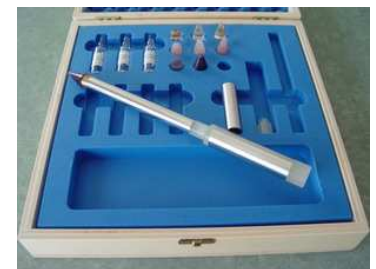
Acupuncture device used for acupuncture points and meridians

"With her own equipment she treated her daughter daily and achieved amazing improvements"